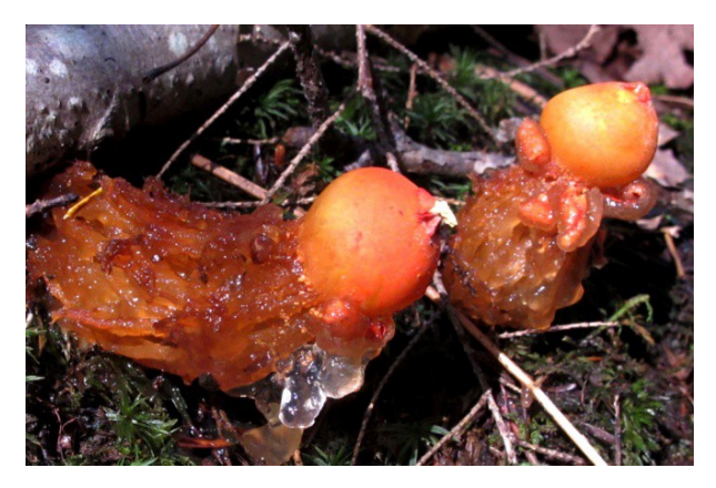
Calostoma cinnabarina (this one is not frozen)

Winter is a good time to think about big forays and events coming in 2013 and plan ahead. Here are some for you to consider: